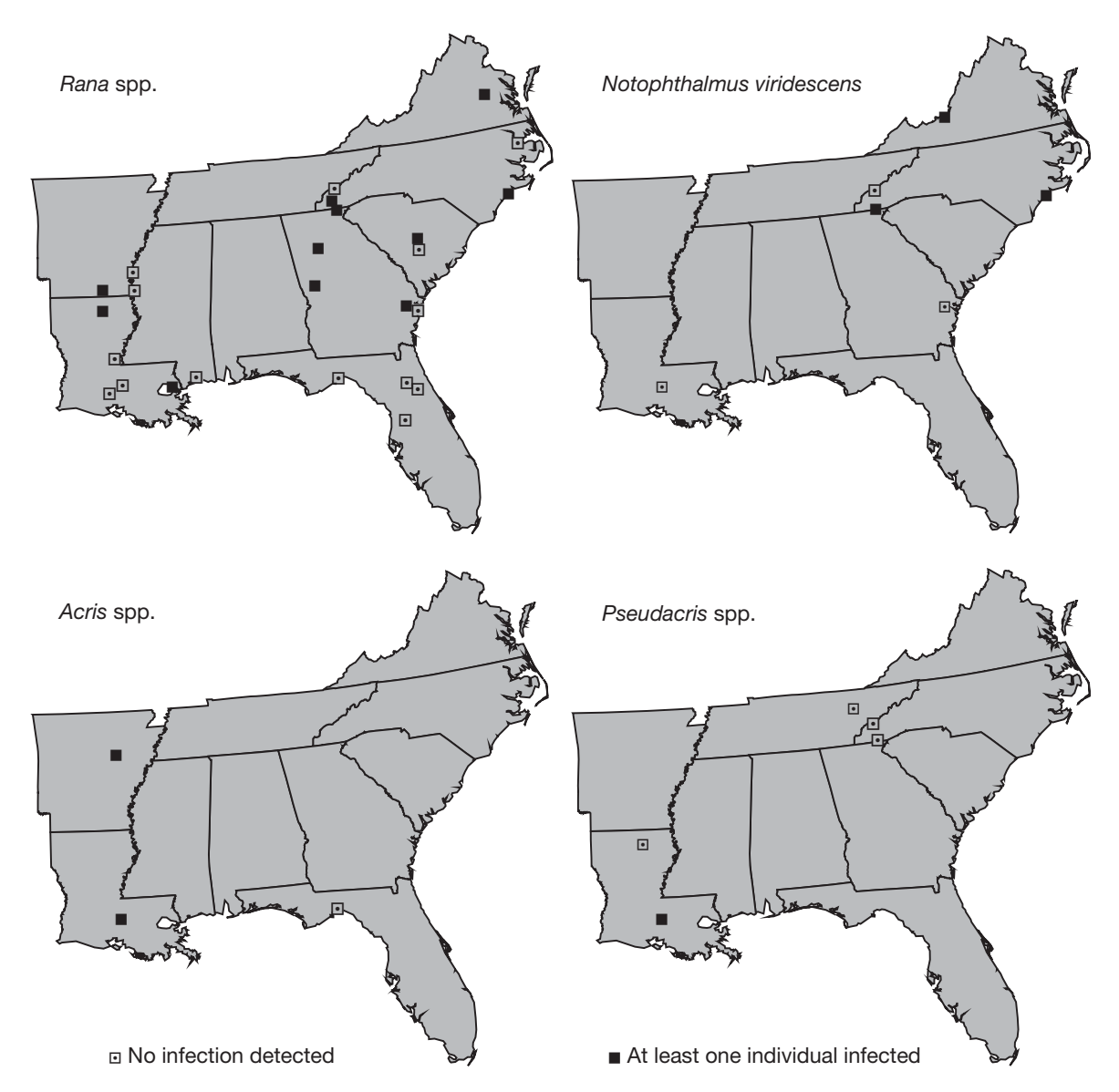
Fig. 2. Geographic distribution of Batrachochytrium dendrobatidis infection in 4 amphibian taxa that were sampled at multiple sites in the southeastern USA. Infection was also detected in 1 of 9 gray treefrogs ( Hyla versicolor or H. chrysoscelis ) at Sherburne Wildlife Management Area in Louisiana, the only site where this species was collected

Ouellet et al. 2005), this is the first report of infection in P. crucifer and P. fouquettei .